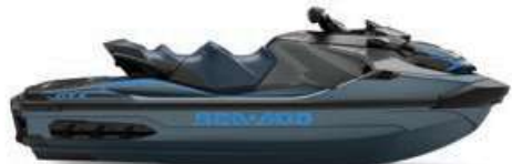
Blue Abyss and Gulfstream Blue